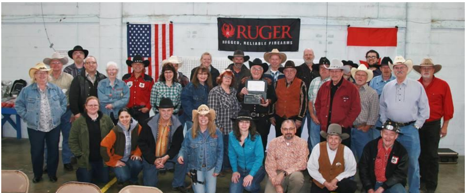
Winners at Greenville Ohio