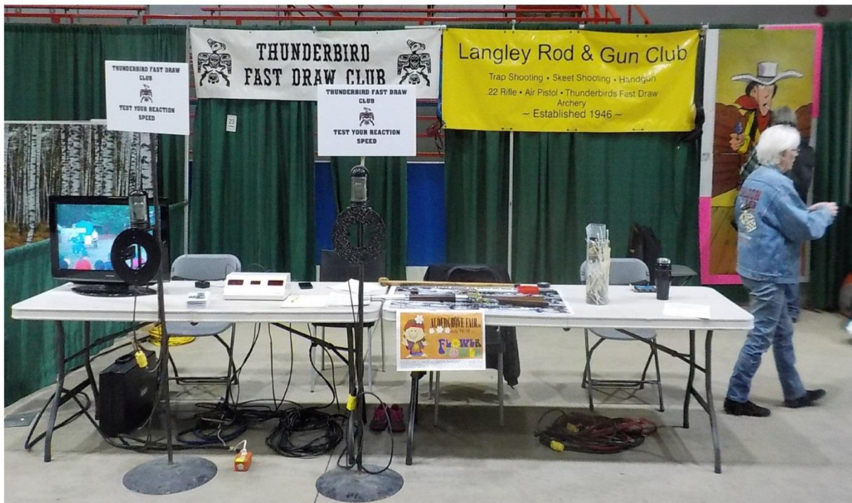
START OF THE THUNDERBIRD FAST DRAW CLUB'S REACTION BOOTH AND FAST DRAW ITEMS-MINUS THE 'RIFLEMAN'S RIFLE' AND 'MARE'S LEG' AND PHOTO ALBUMS WHICH WERE YET TO COME FOR THE CLOVERDALE HUNTING AND FISHING SHOW OF 2017- A VERY BUSY THREE DAYS...!