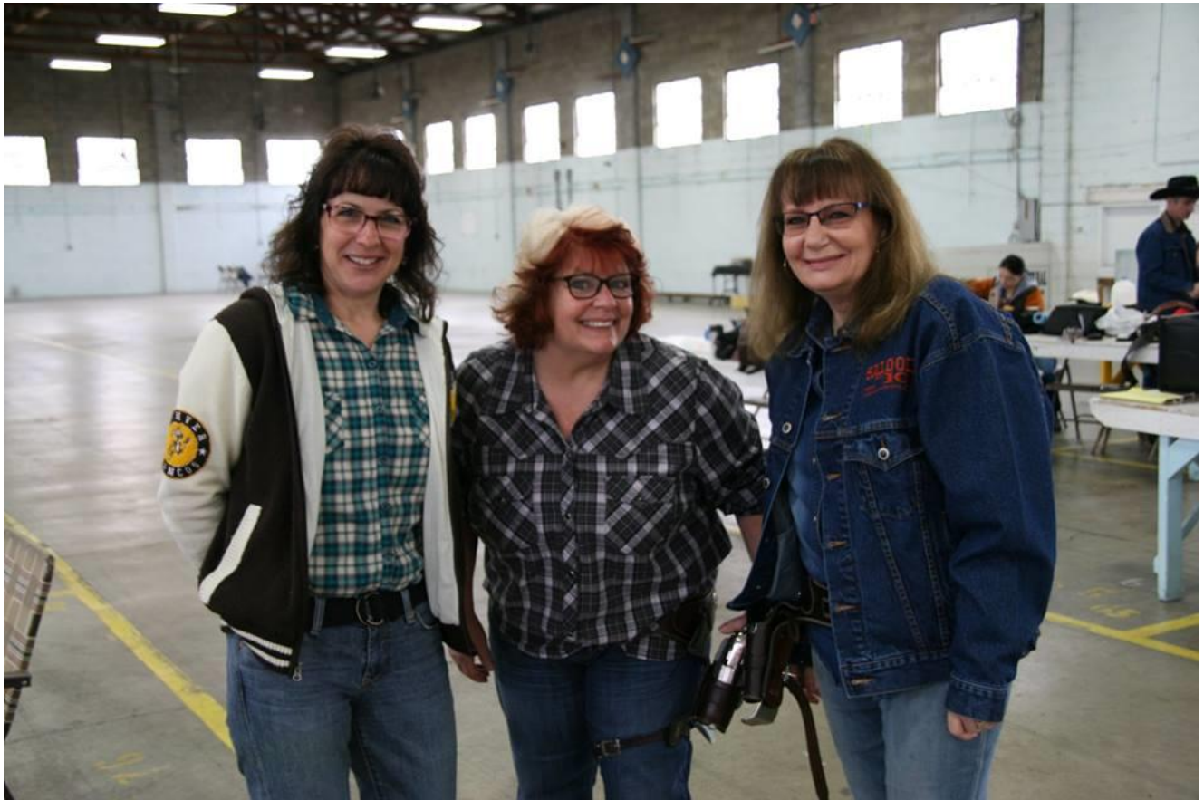
The organizing crew.