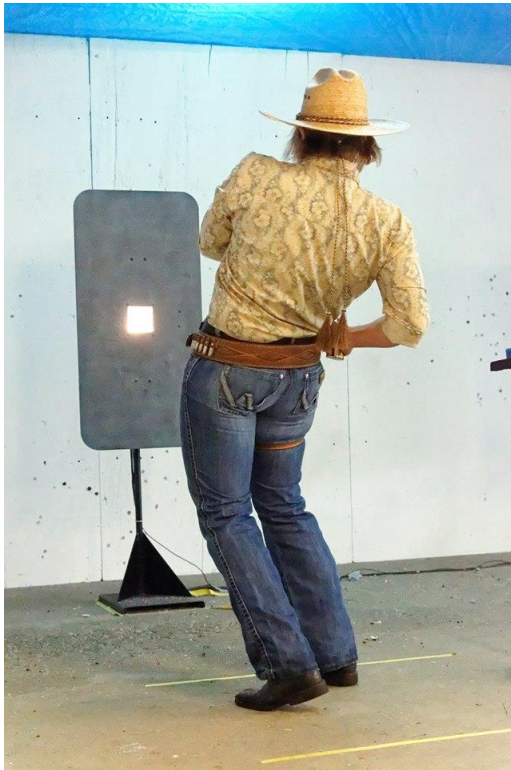
Was great to see the Knicks on the line again