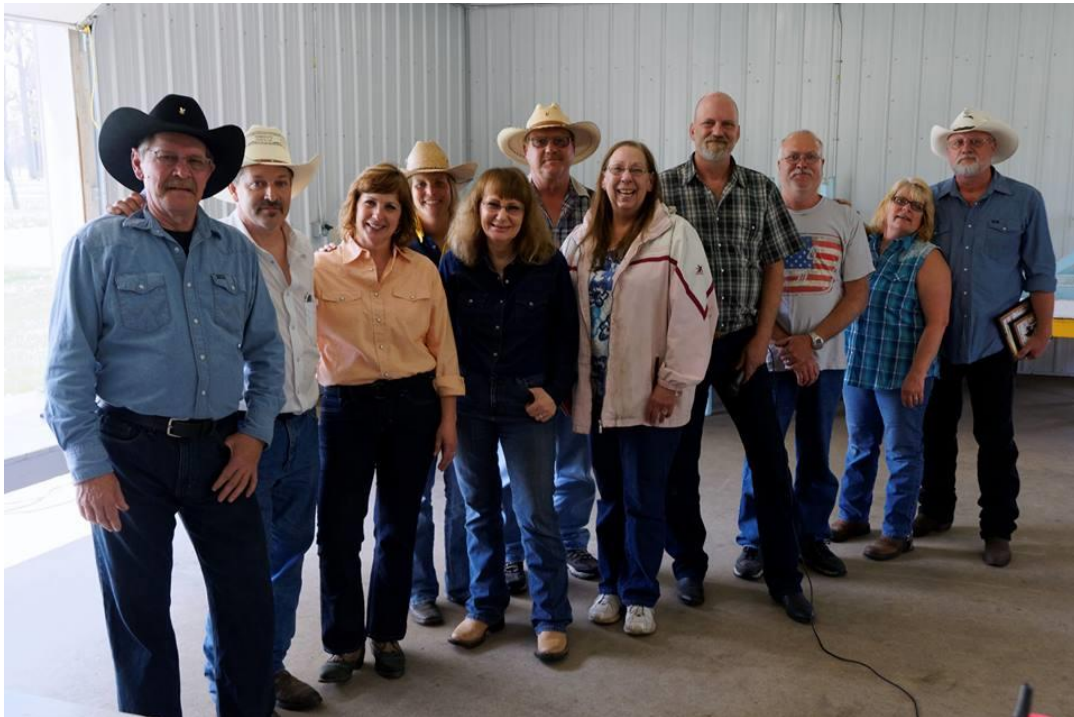
Good folks who put on a great contest.