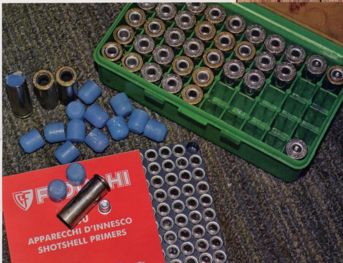
Fast draw ammunition includes 45 Colt modified cases, Shotgun 209 primers and wax bullets.

Targets can be either balloons broken with blanks or steel plates with motion sensors that detect the impact of wax bullets. Electronic timers measure to one-thousandth of a second and are programmed to signal randomly, so neither the competitors, nor the time keeper, knows exactly when the signal