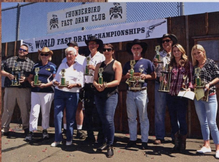
The celebrity shoot included politicians, media personnel and entertainers.