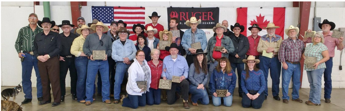
OUR BIG FAMILY IN OHIO