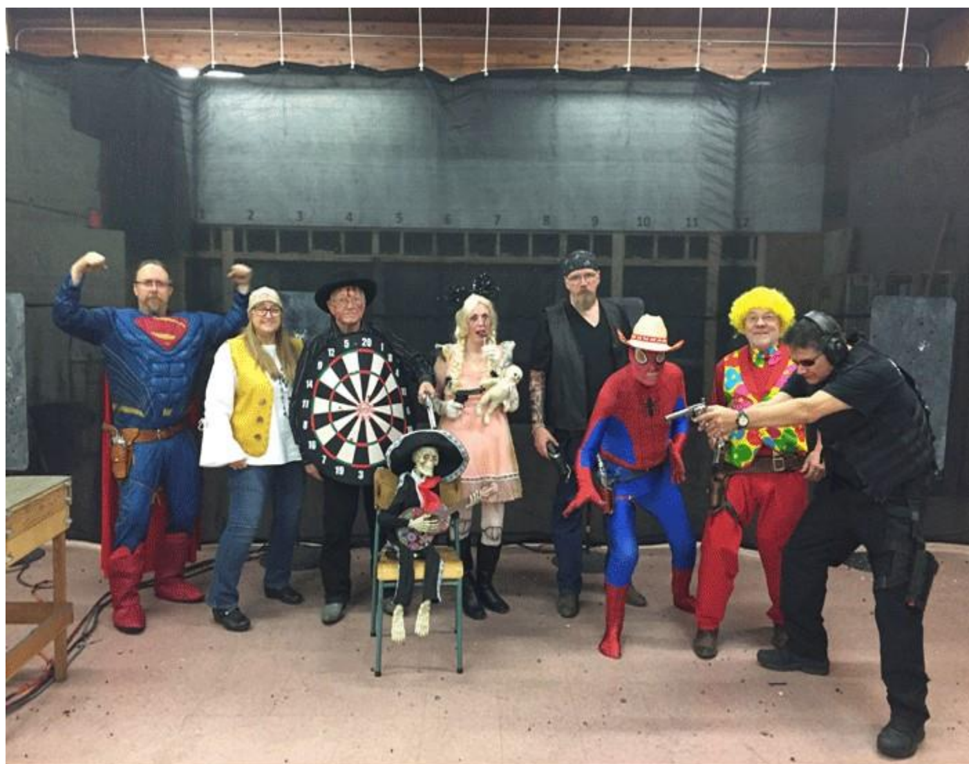
The gangs all here for Halloween