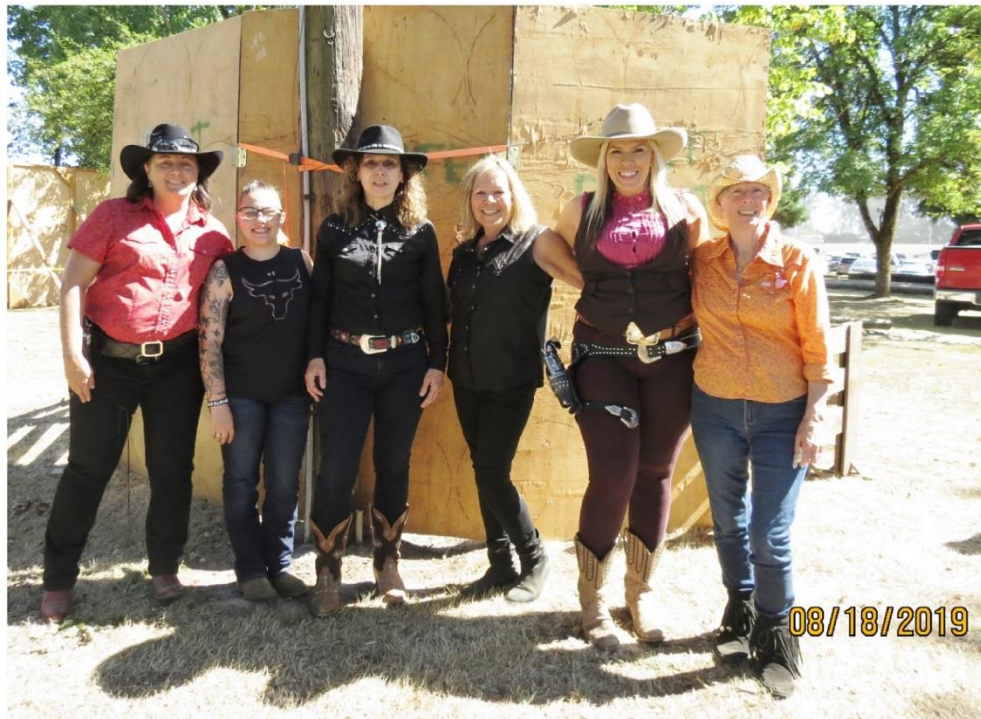
SOME OF THE 2019 OREGON GAL GUNSLINGERS-MANY MORE PHOTOS TO COME IN FUTURE!

( MORE PHOTOS OF THE OREGON CONTEST BY PAT QUESNEL AND KAREN ROBINSON, THAT IS....)