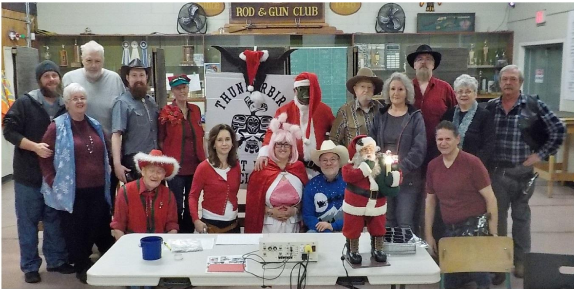
MERRY CHRISTMAS AND HAPPY NEW YEAR TO ALL-FROM THE THUNDERBIRD FAST DRAW CLUB!