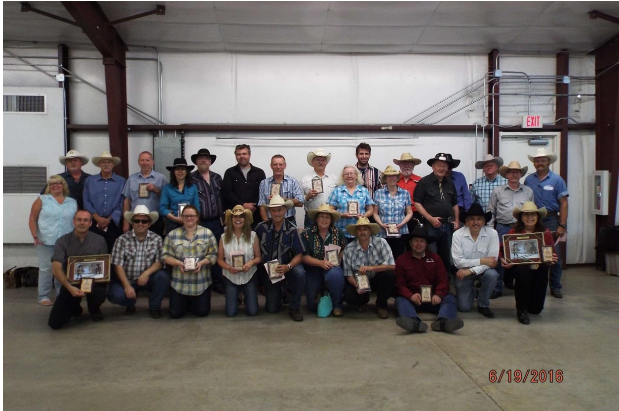
Mountain View Arkansas Group Photo