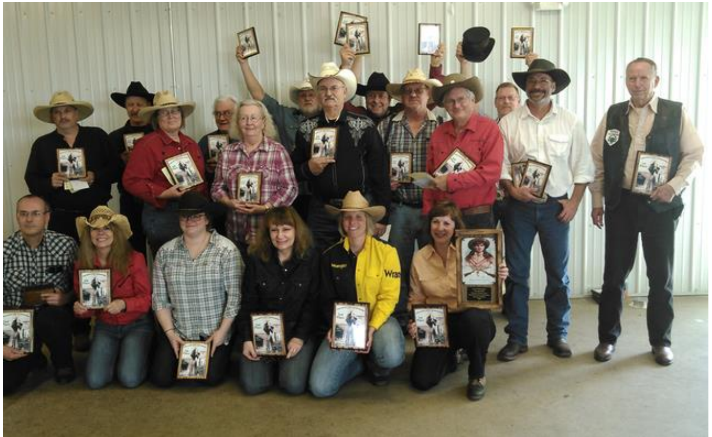
Greenville, Ohio Shooters