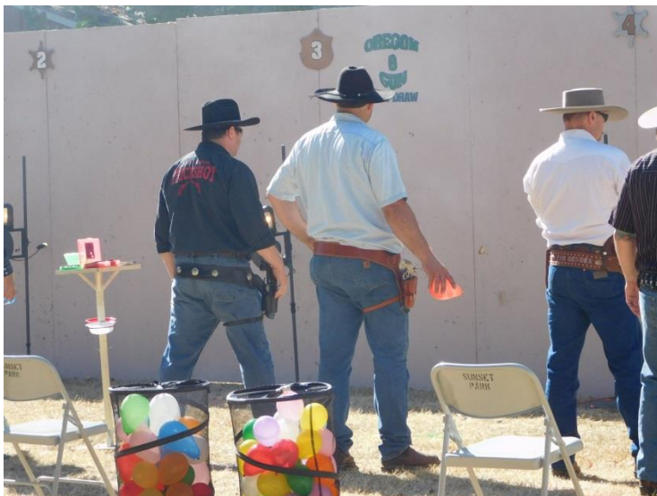
Tin Bender, Oregon