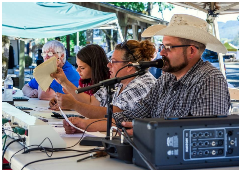
Scoring table in Banks Oregon.