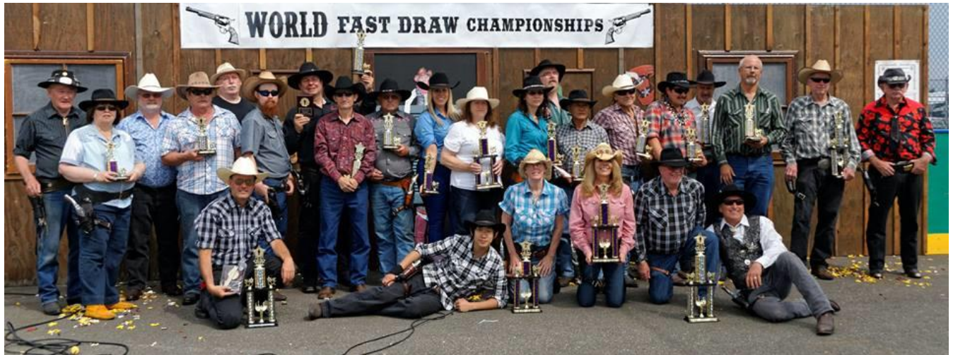
Canadian Contest Shooters