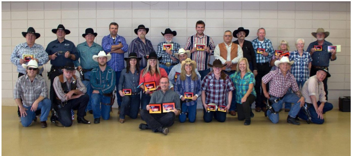
Baker Montana Shooters