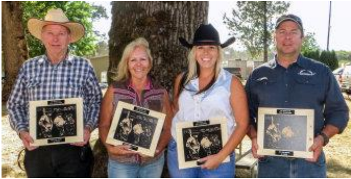
Banks Oregon Winners