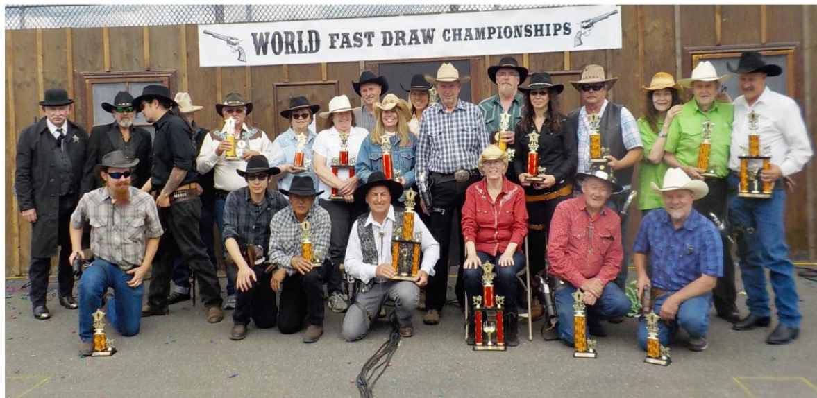
ALL ARE WINNERS AT THE WORLD'S OPEN BLANK INDEX AND THE NEW CANADIAN GUN-THUMBERS CHAMPIONSHIPS