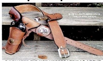
#DONATED RIG NOT NECESSARILY AS ABOVE. WWW.BOB'SLEATHERWORKS.COM