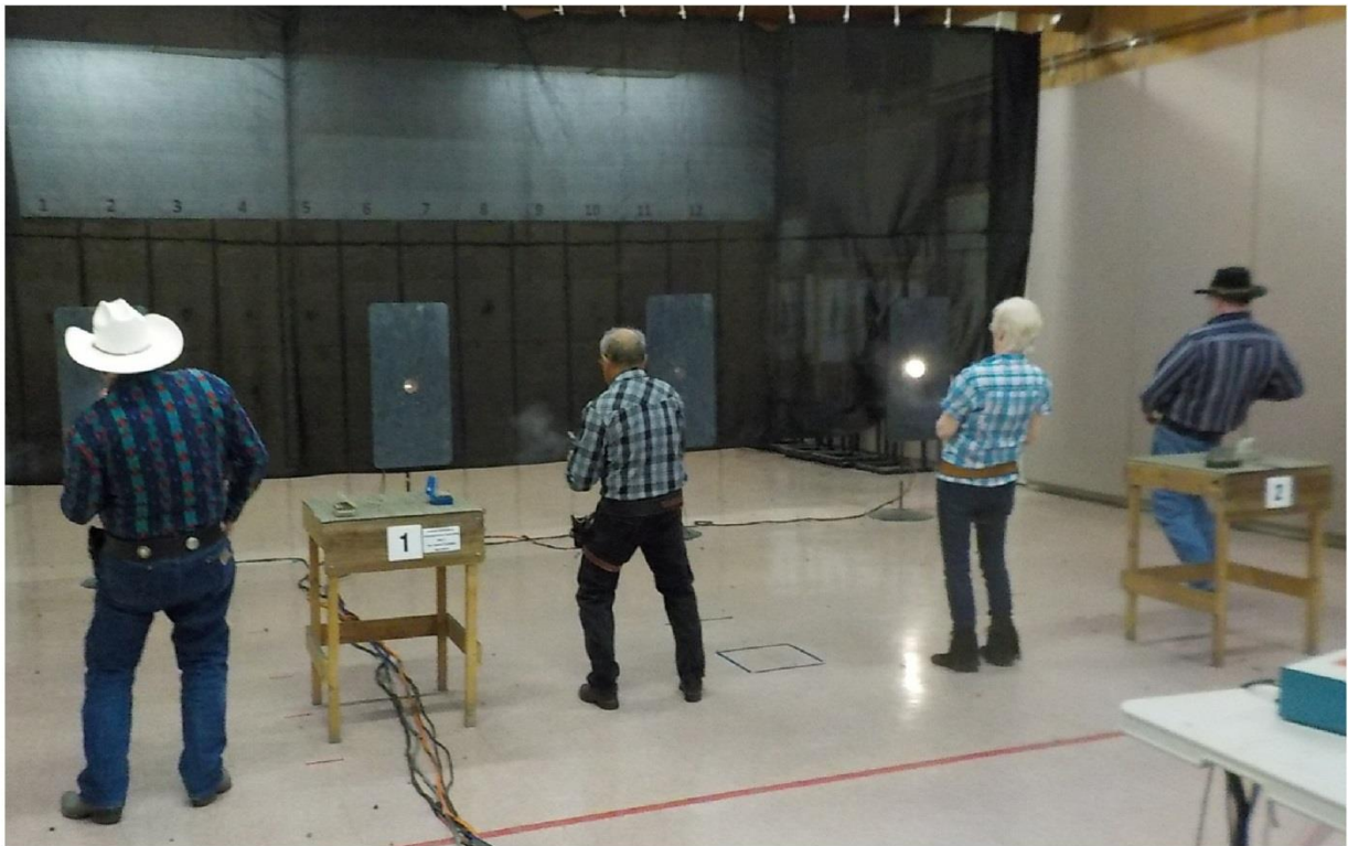
A 'TRIGGER-TYPICAL' FRIDAY NIGHT WITH THE T/BIRDS.