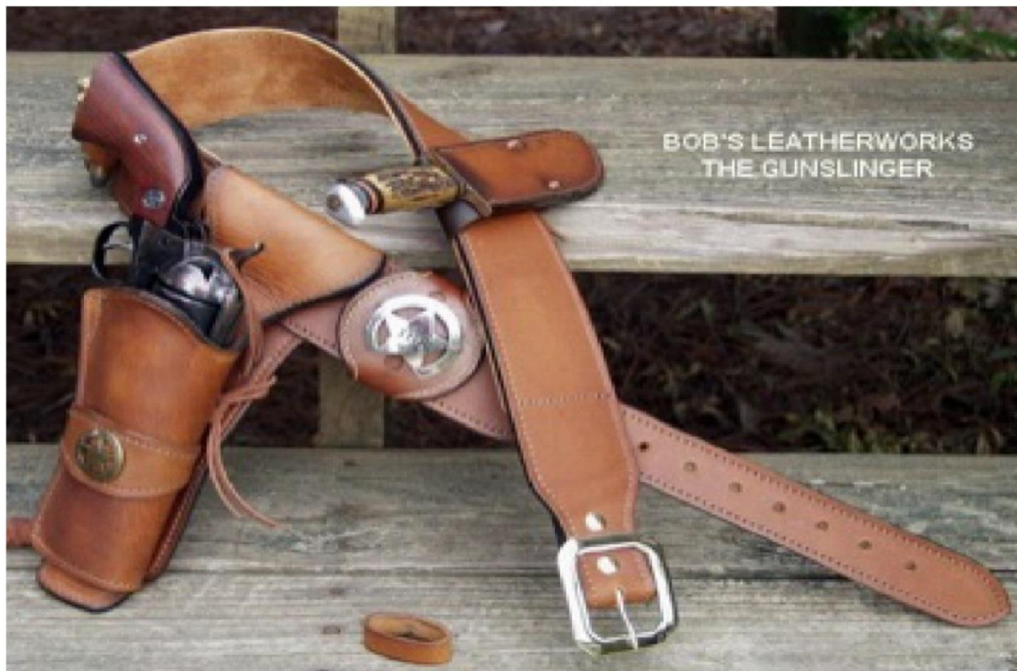
#DONATED HOLSTER NOT NECESSARILY AS ABOVE WWW.BOBSLEATHERWORKS.COM