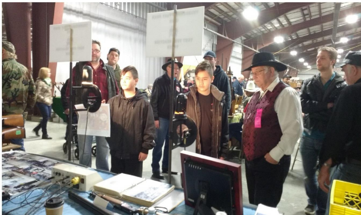
VISITORS @ THE H.A.C.S. SHOW TAKE QUITE AN INTEREST IN TBIRD'S 'REACTION RANGE'!